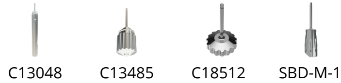
C13048 C13485 C18512 SBD-M-1