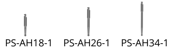
PS-AH18-1 PS-AH26-1 PS-AH34-1